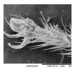
RTNN Take-out Science

The RTNN announced a weekly microscopy program for your quarantined viewing pleasure. Take-out Science will be held every Tuesday at noon. Each week, an RTNN scientist will explore a different theme using both a light microscope and a portable scanning electron microscope. Bring your lunch and your questions!